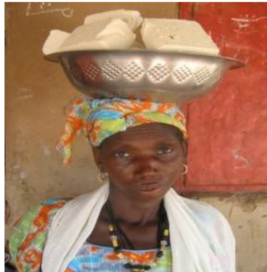
One of the women benefiting from credit facility advanced by credit unions for SOAP making project