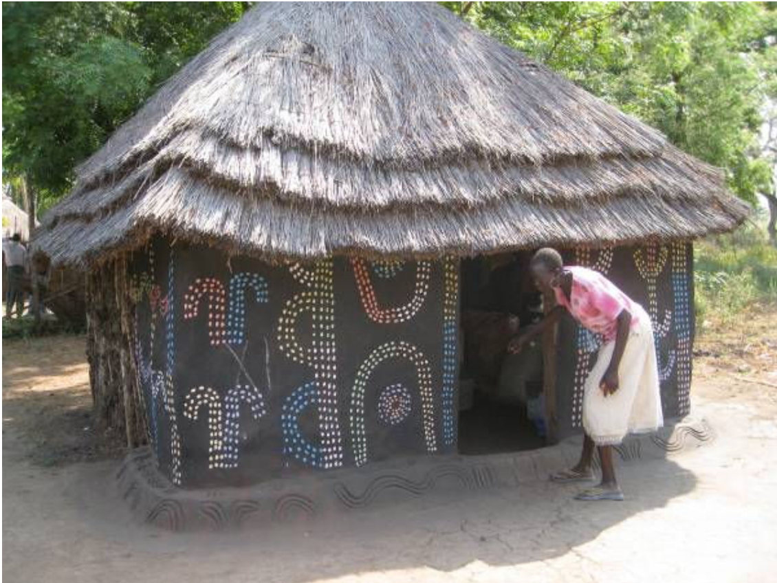
Vol 1, Issue 2