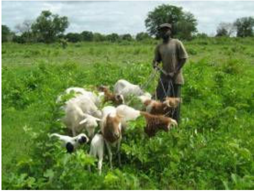
Animal project being management by Credit union